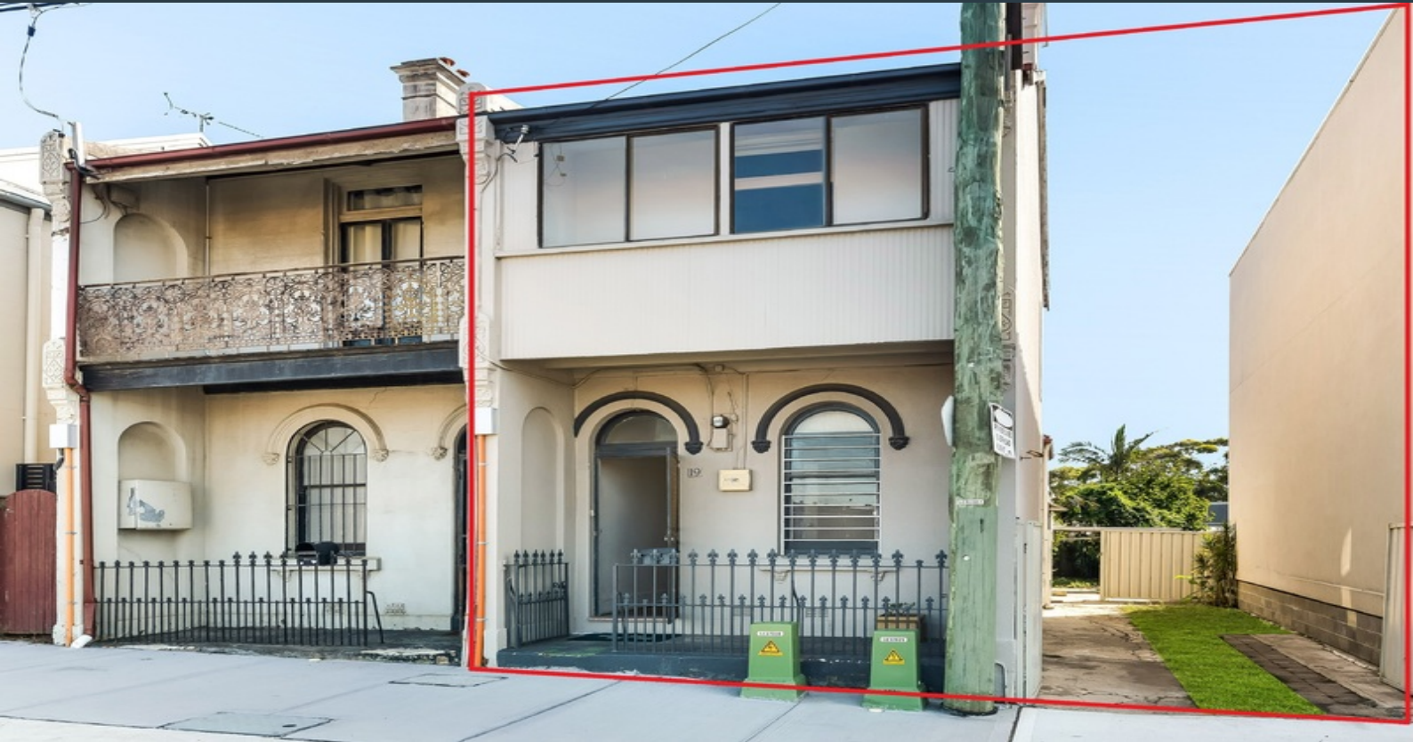
PROPOSED ALTERATIONS ADDITION - 19 CAMPBELL ST. ST PETERS.