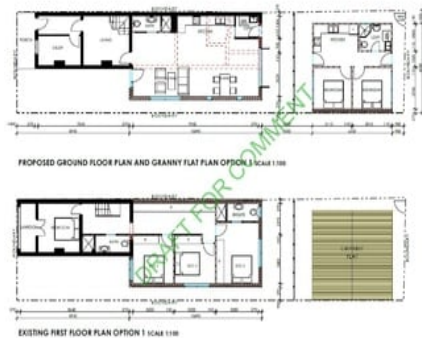
PROPOSED ALTERATIONS ADDITION - 19 CAMPBELL ST. ST PETERS.