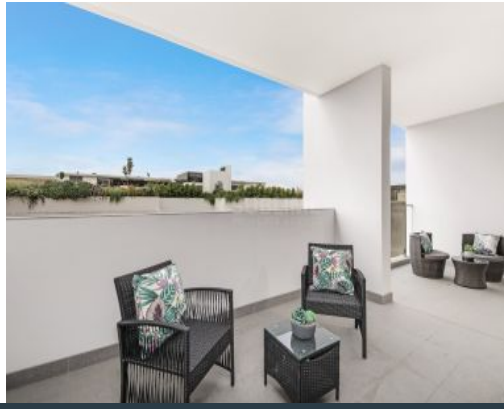
510/55 Princes Highway St Peters, NSW