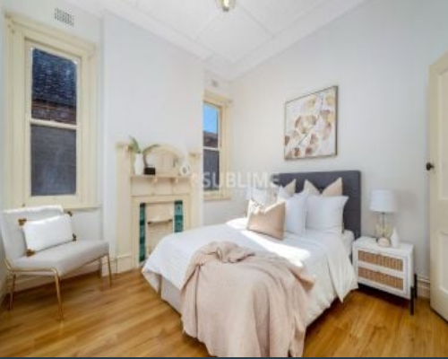
9 Broughton Street Canterbury, NSW