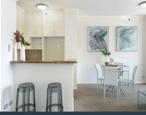
298 Sussex Street Sydney, NSW